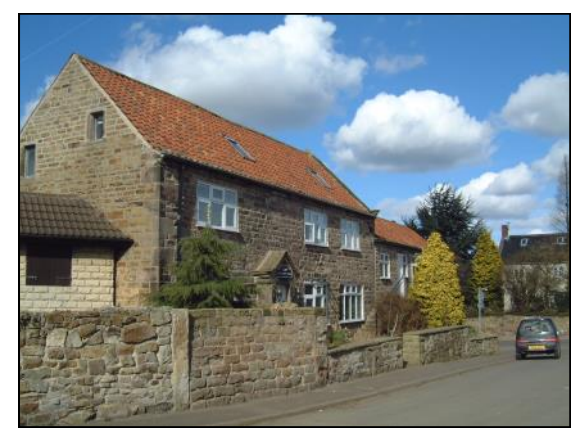
White Horse Farm Woodall