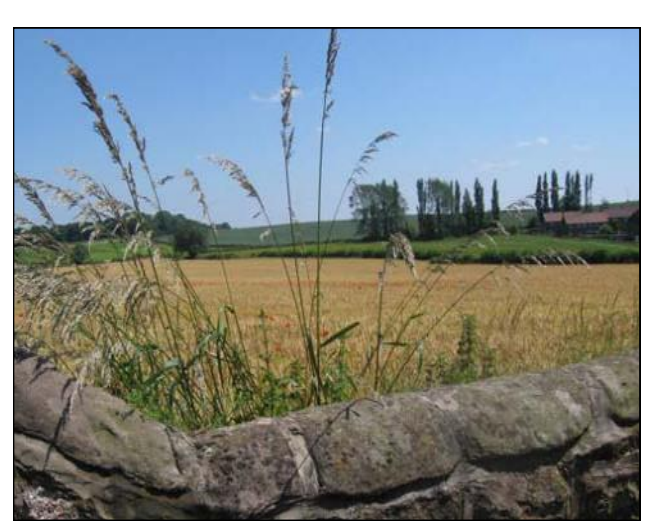
Towards Crow Wood

Park in the car park on Woodall Lane, next to sports centre.