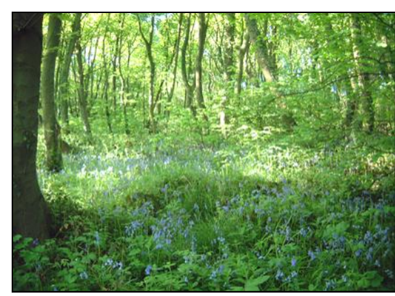
Bluebells in Loscar Common Plantations