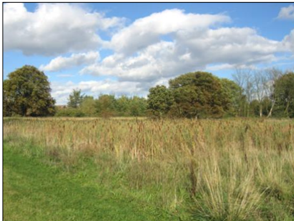
Kiveton Community Woodland

Park in the car park on Woodall Lane, next to sports centre. There are toilets as you pass Kiveton Waters.