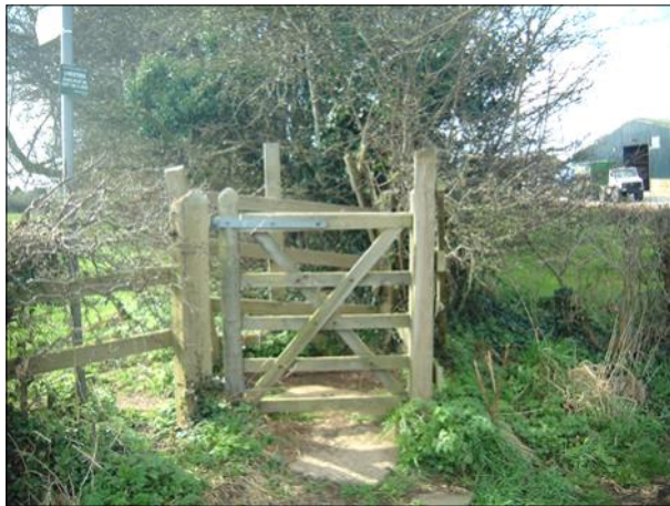
Kissing Gate on Manor Road