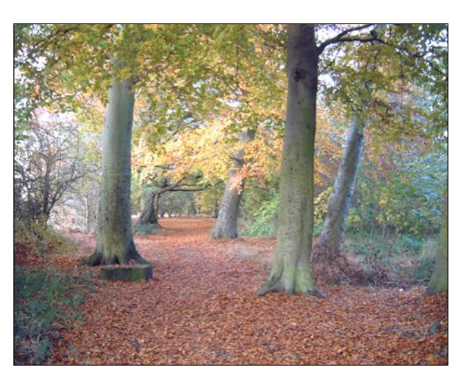
Tom Wakefield Way in Autumn