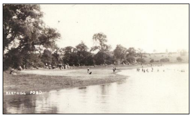
Harthill Ponds in 1933

1. Continue straight ahead at the bridge between the second and third reservoir (pond) - don't go over it. Follow the path around the edge of the field until you see a way marker to the right.