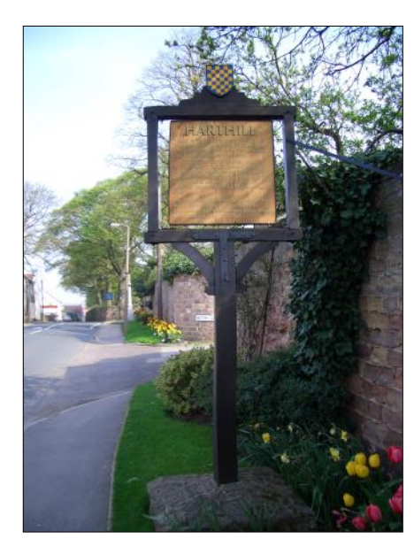
The Domesday Sign