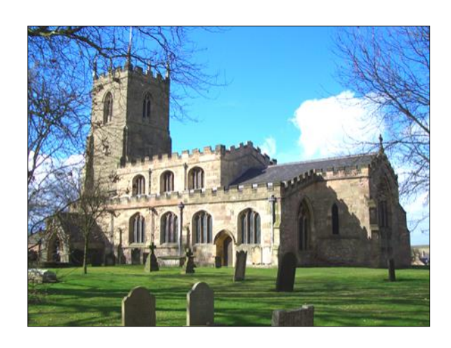
All Hallows Church, Harthill

Park in the car park on Woodall Lane, next to sports centre.