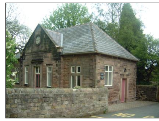
The Old Schoolroom