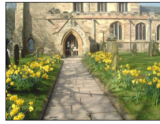
All Hallows Church in the Spring