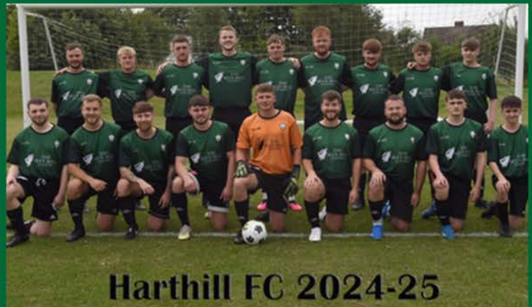
Harthill FC 2024-25

Finally, thank you to the village for your ongoing support. Up the Til! Harthill FC