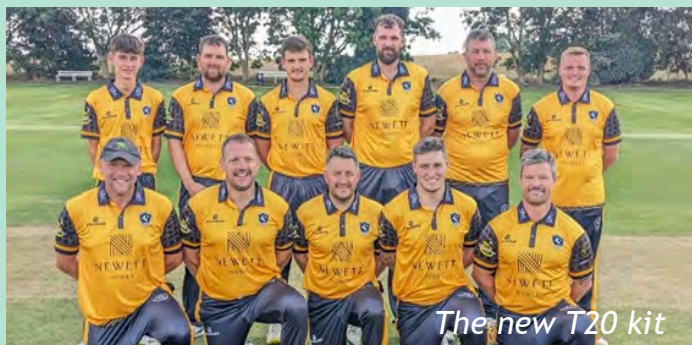
The new T20 kit