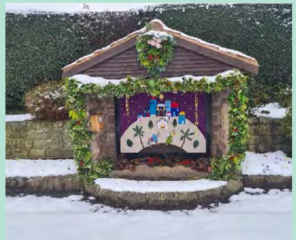
Harthill Well Dressing Christmas 2023

Harthill Primary School children will be there to sing for us as well as the choir of Harthill Voices. Musicians from Harthill Morris and friends will accompany the carols. After the blessing, Mince Pies, provided by the Carnival Society, will be served in the church along with a Hot Toddy. There will be fruit juice and Christmas biscuits for the children. The well dressing will be then placed in the well for the Christmas period.